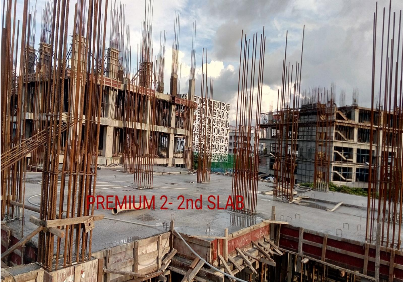
PREMIUM 2 – 2nd SLAB