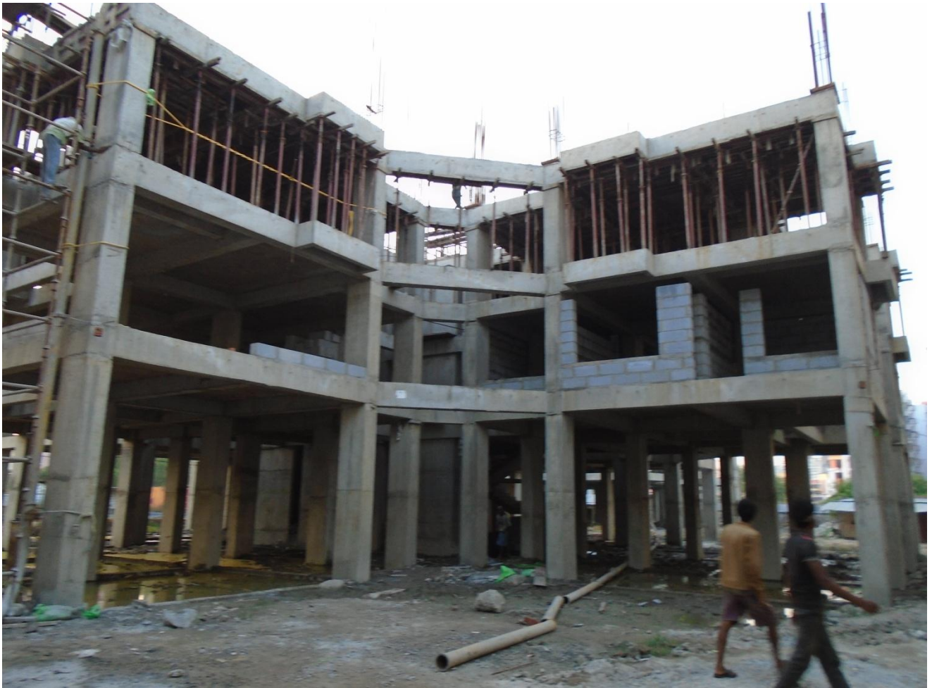
CLASSIC – 2