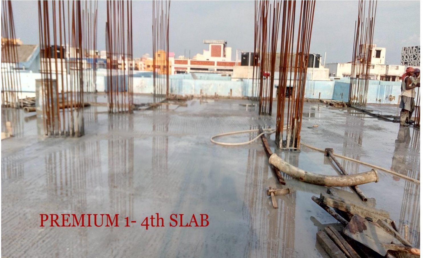
PREMIUM 1 - 4th SLAB