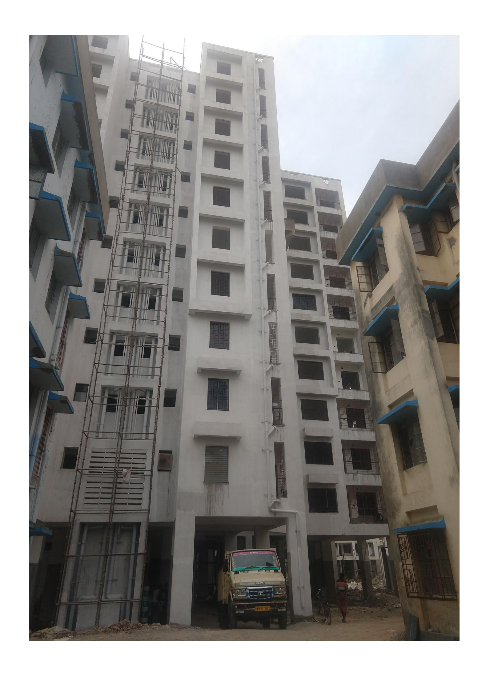
CLASSIC - 1