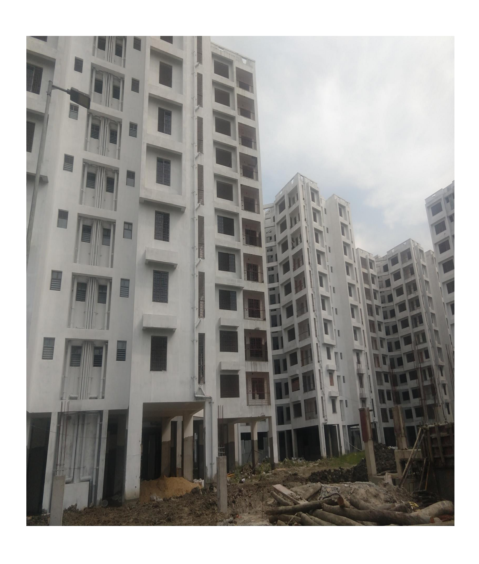
CLASSIC - 3