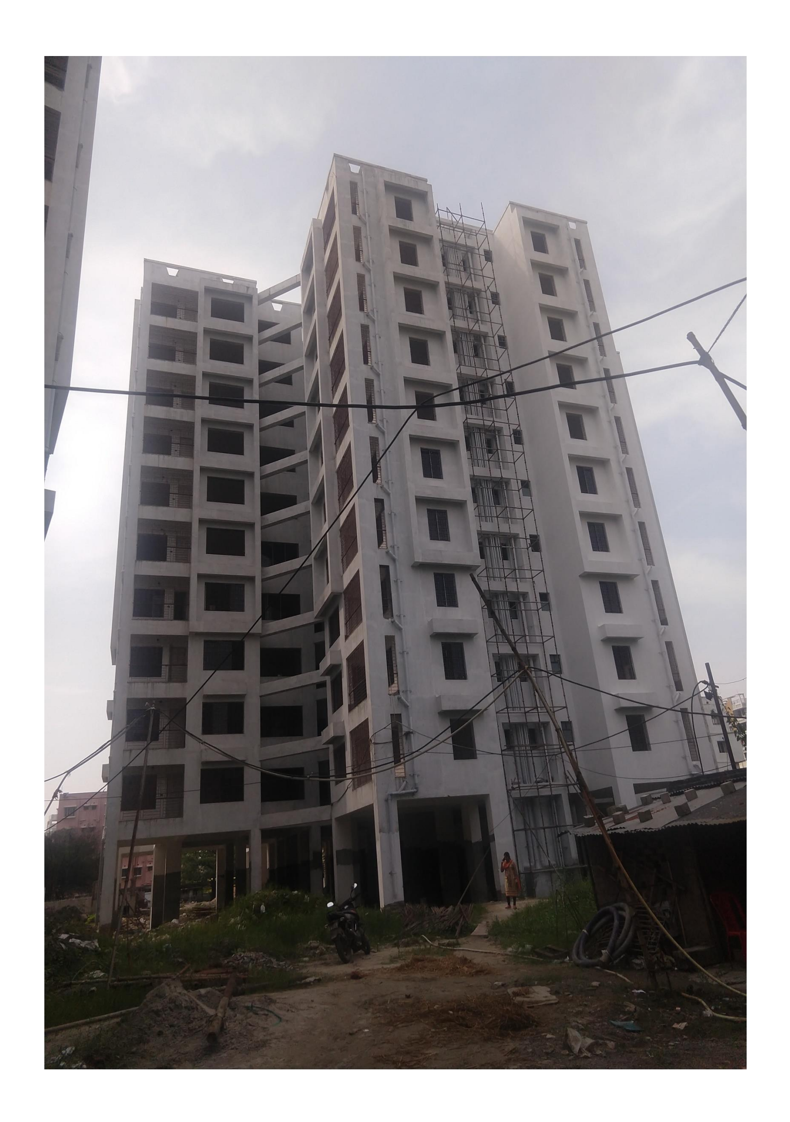
CLASSIC - 3