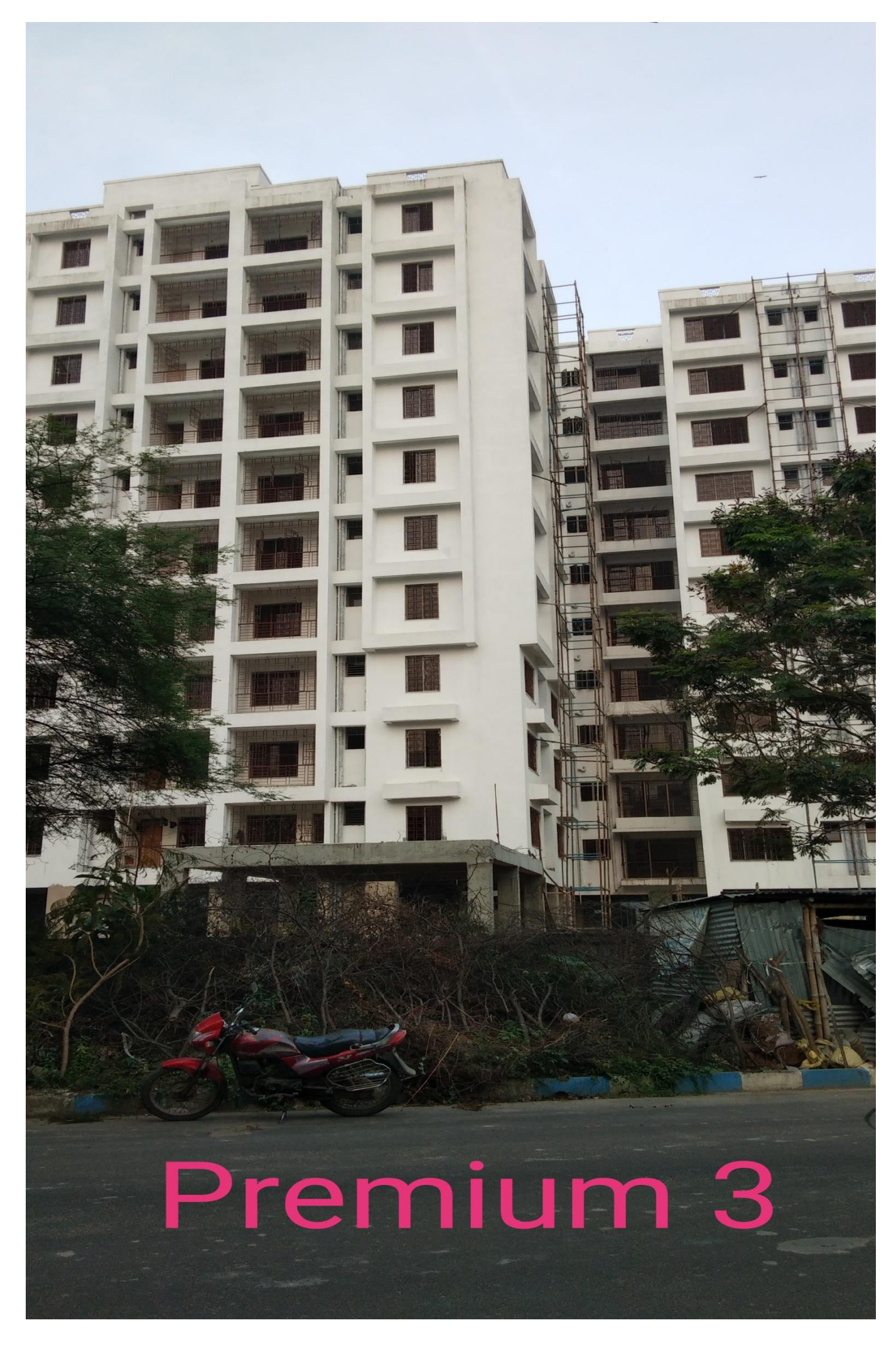
PREMIUM - 3