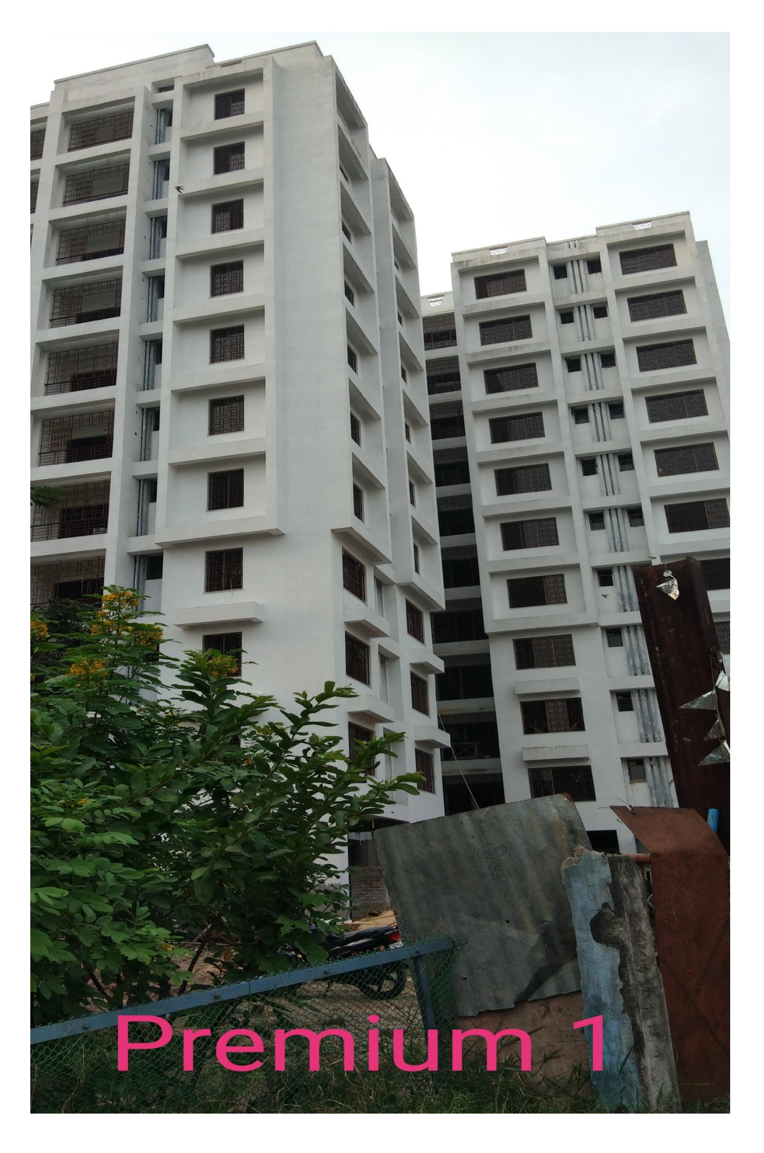
PREMIUM – 1