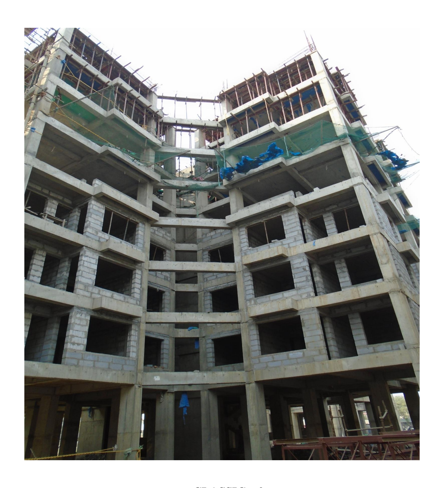
CLASSIC – 2