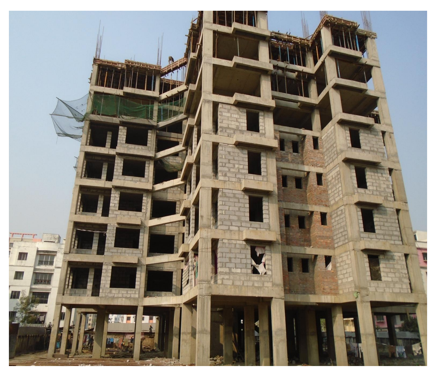
CLASSIC - 3