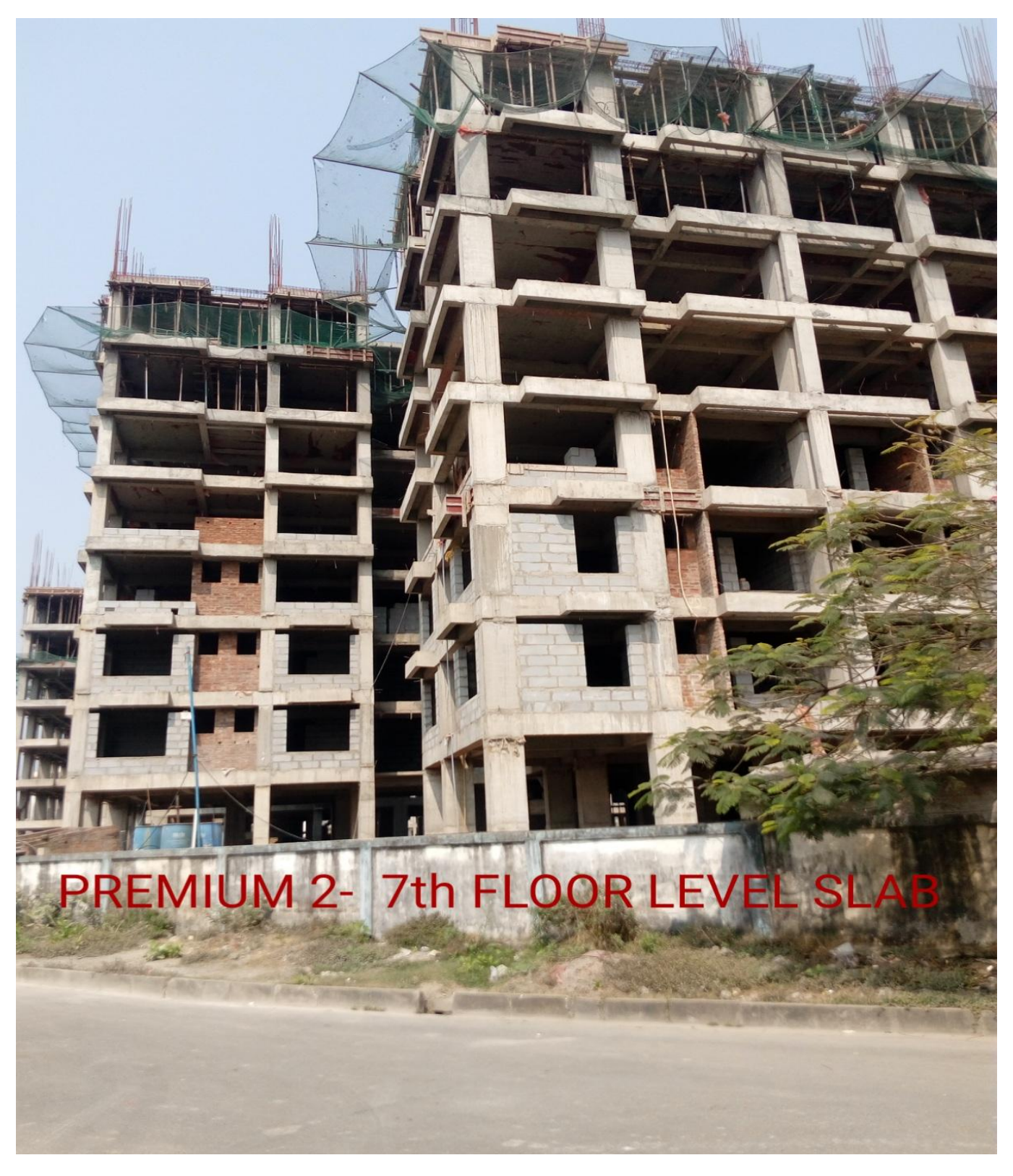
PREMIUM 2-7<sup>th</sup> FLOOR LEVEL SLAB