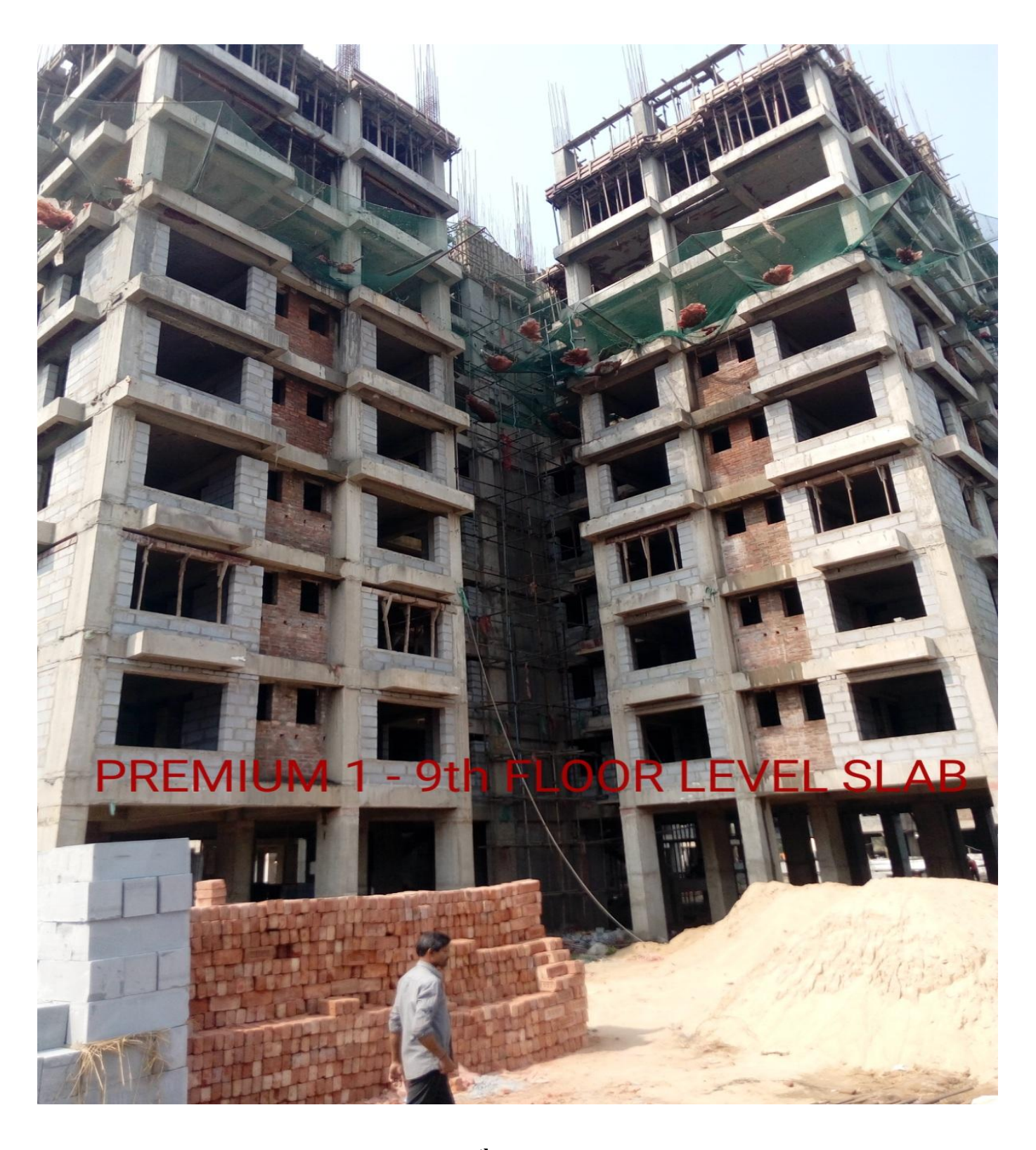
PREMIUM 1-9<sup>th</sup> FLOOR LEVEL SLAB