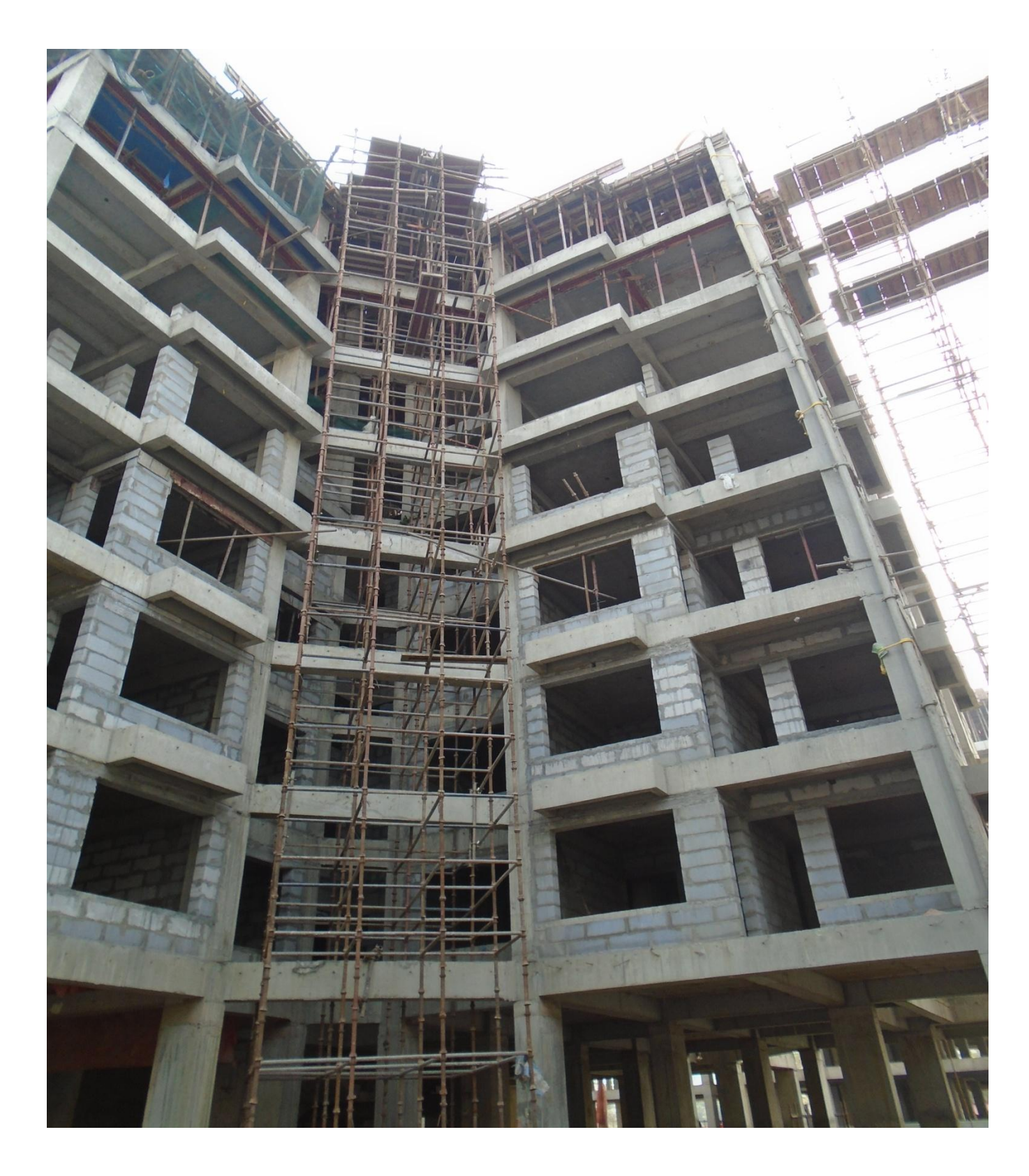
CLASSIC – 1