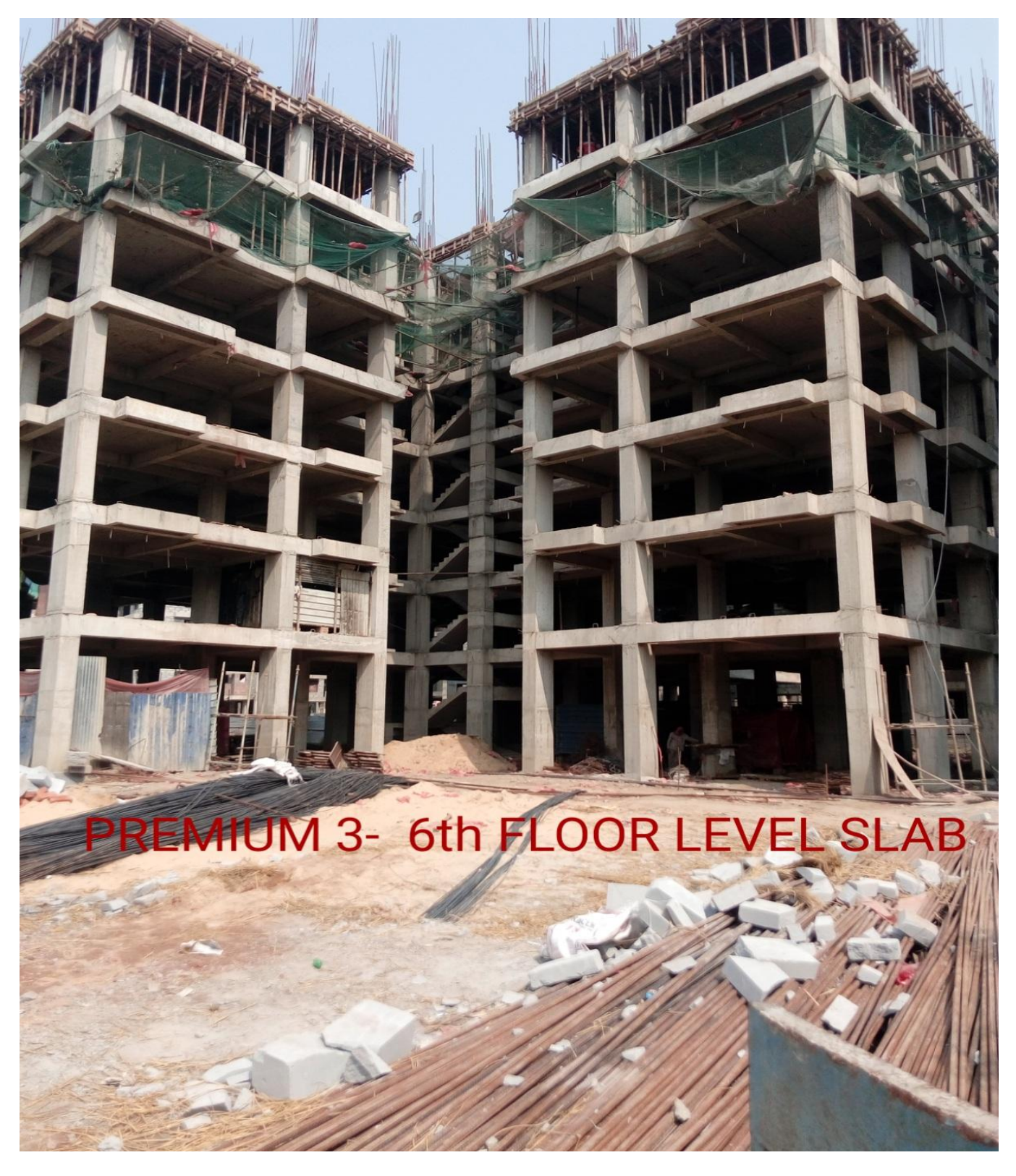
PREMIUM 3-6<sup>th</sup> FLOOR LEVEL SLAB