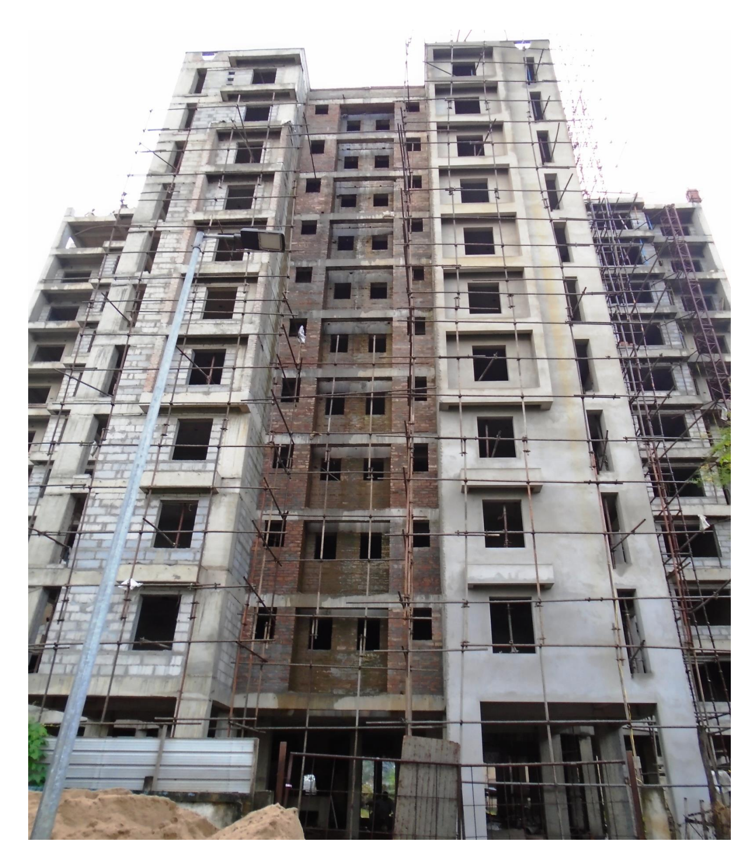
CLASIC - 3