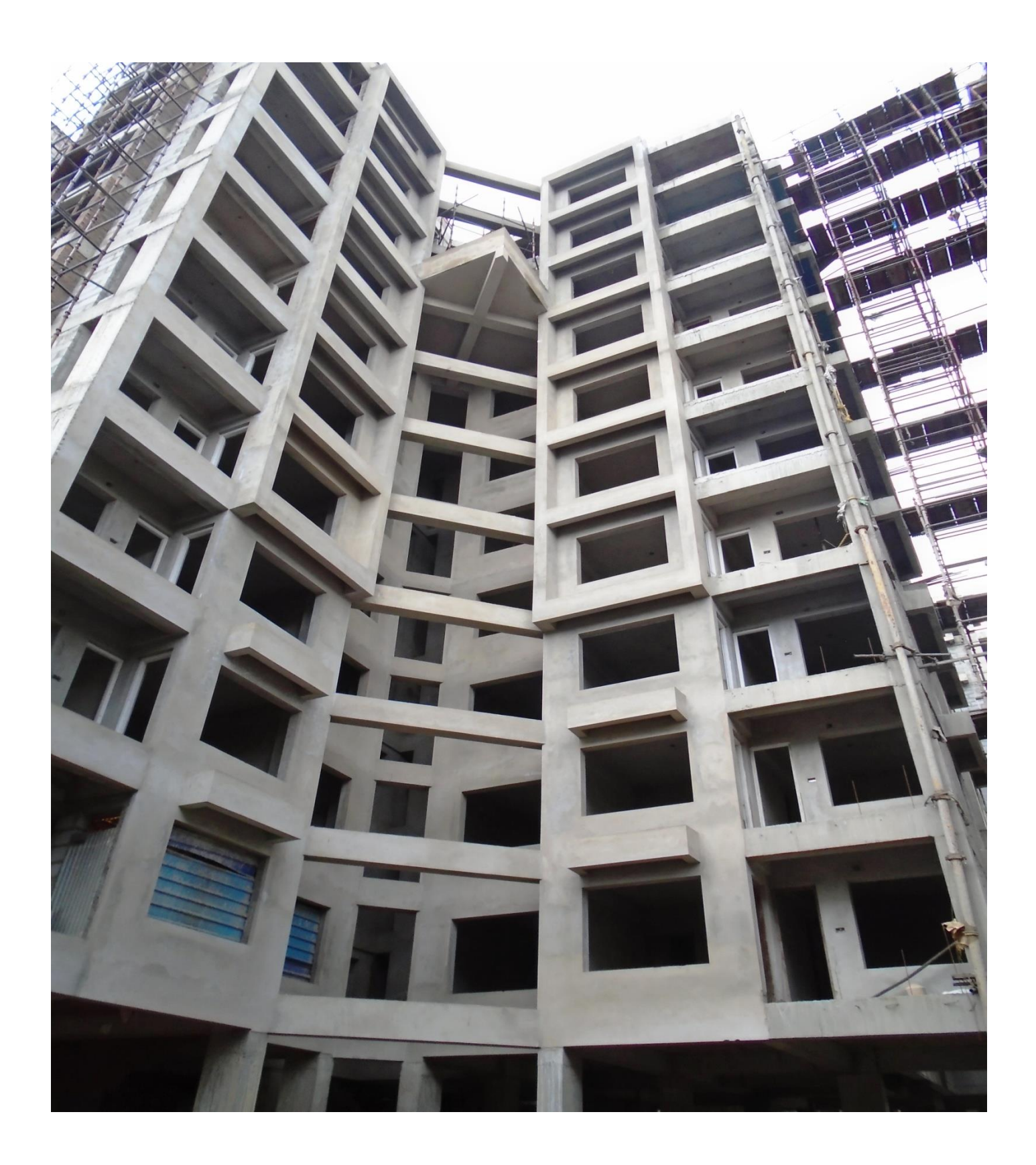
CLASSIC - 1