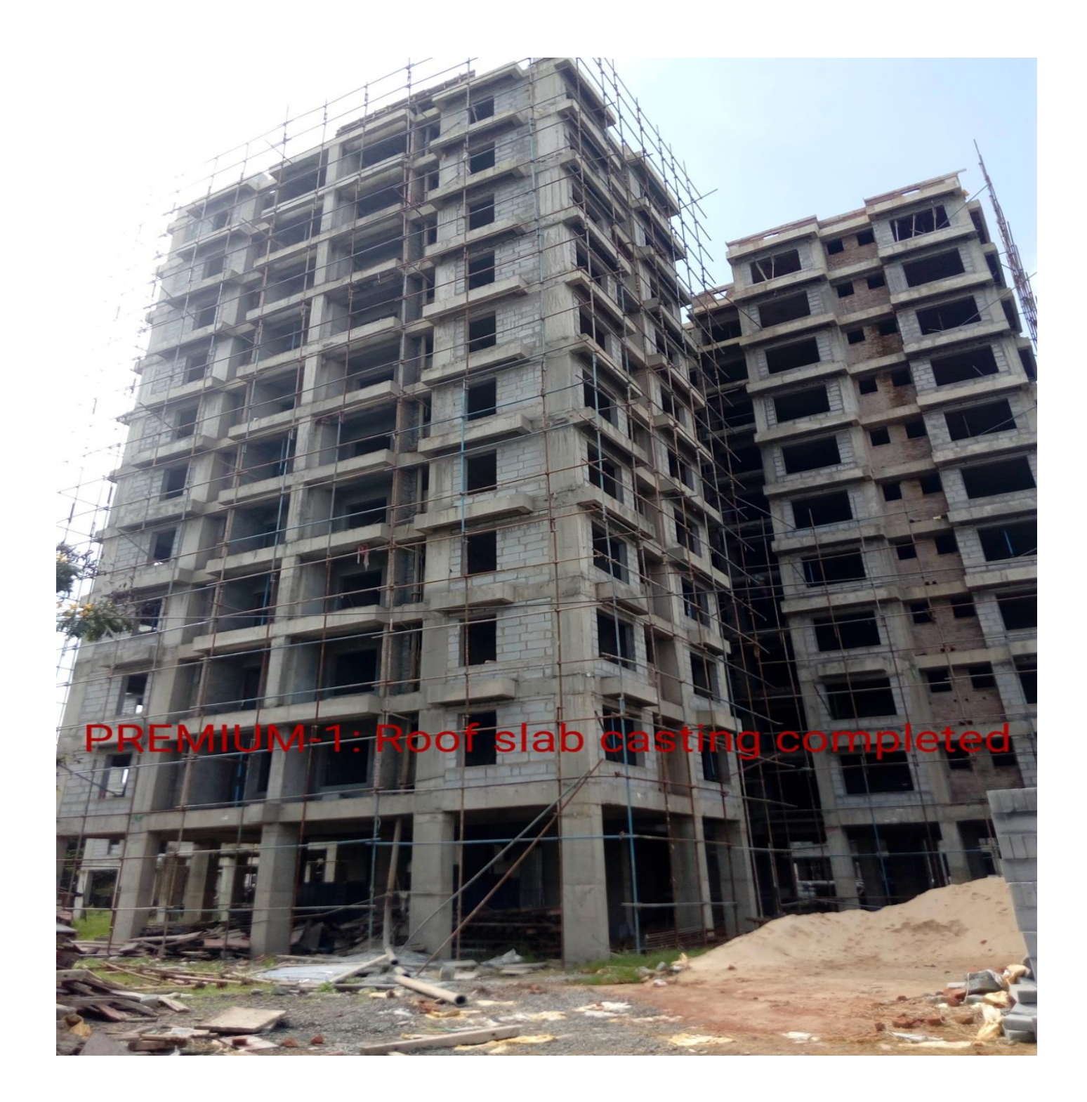
PREMIUM - 1: Roof slab casting completed