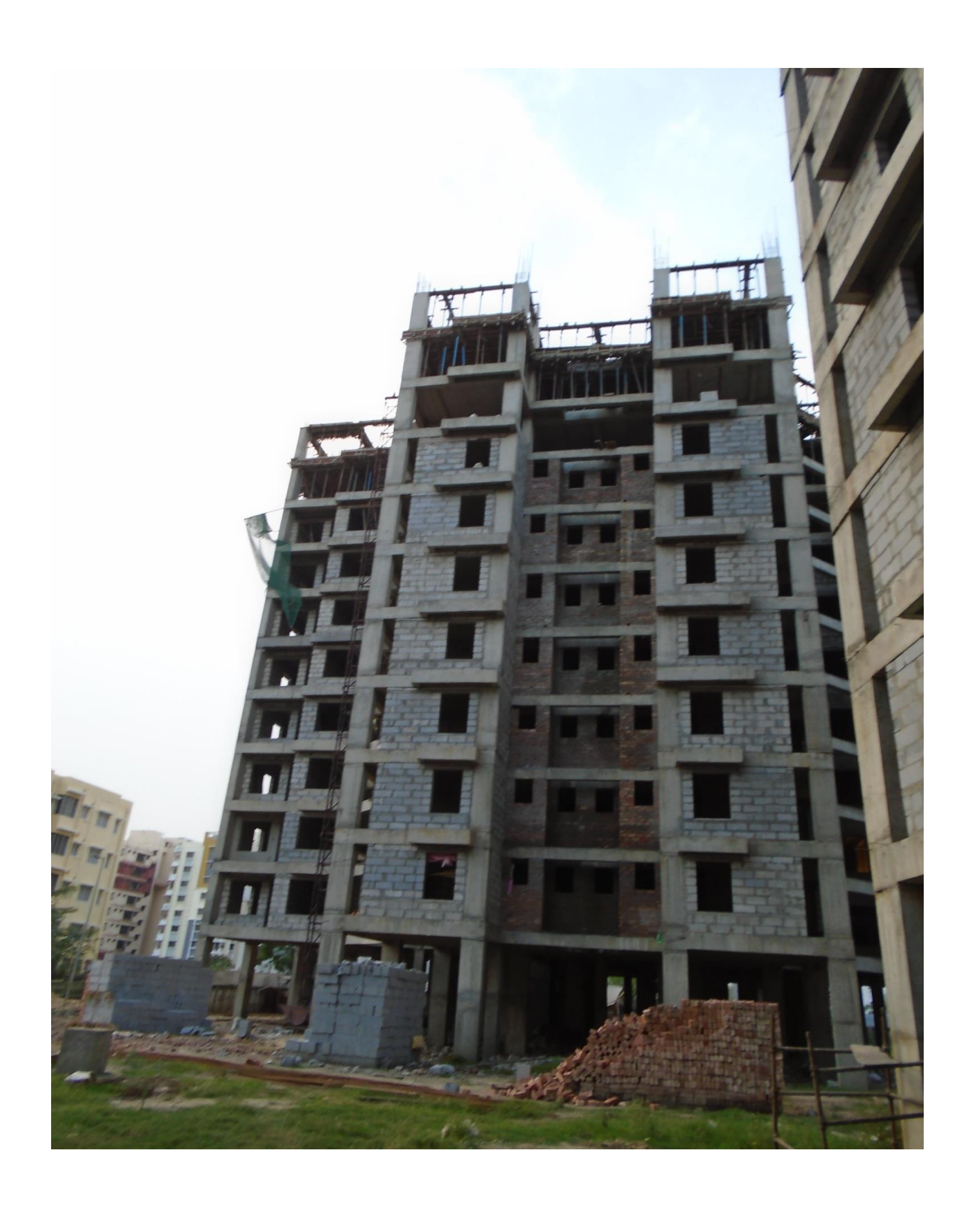
CLASSIC -3 (BACK SIDE)