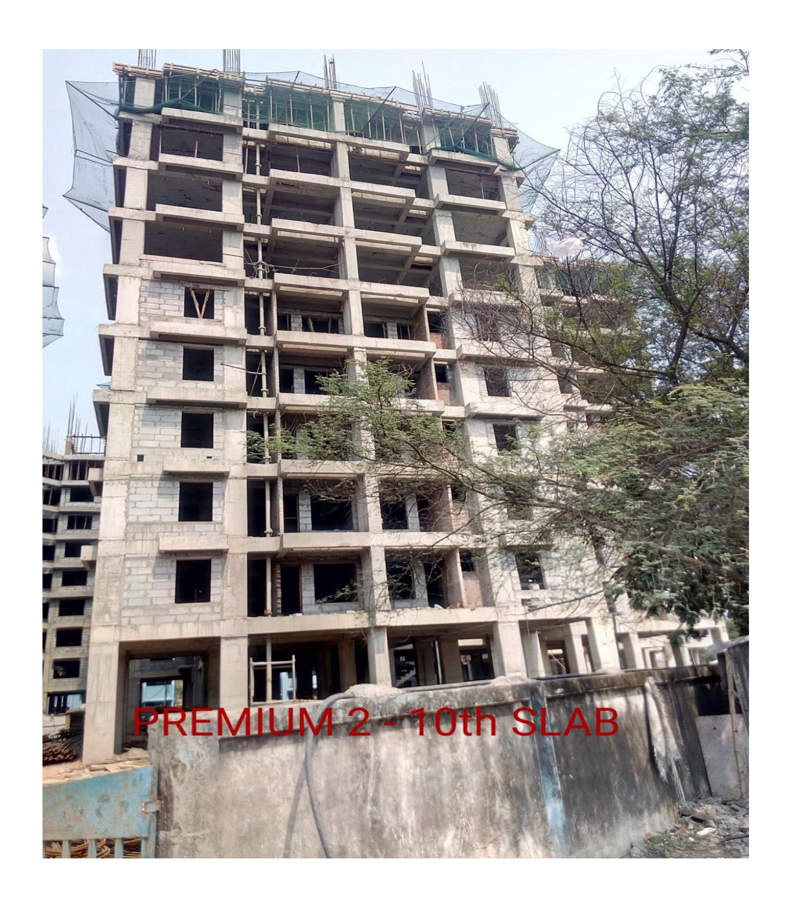
PREMIUM -2- 10th SLAB