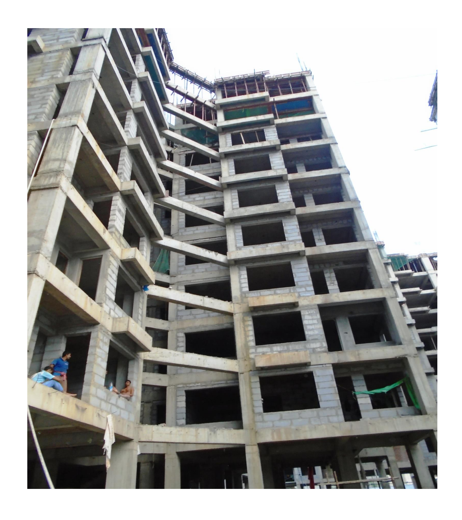
CLASSIC - 1 (BACK SIDE)