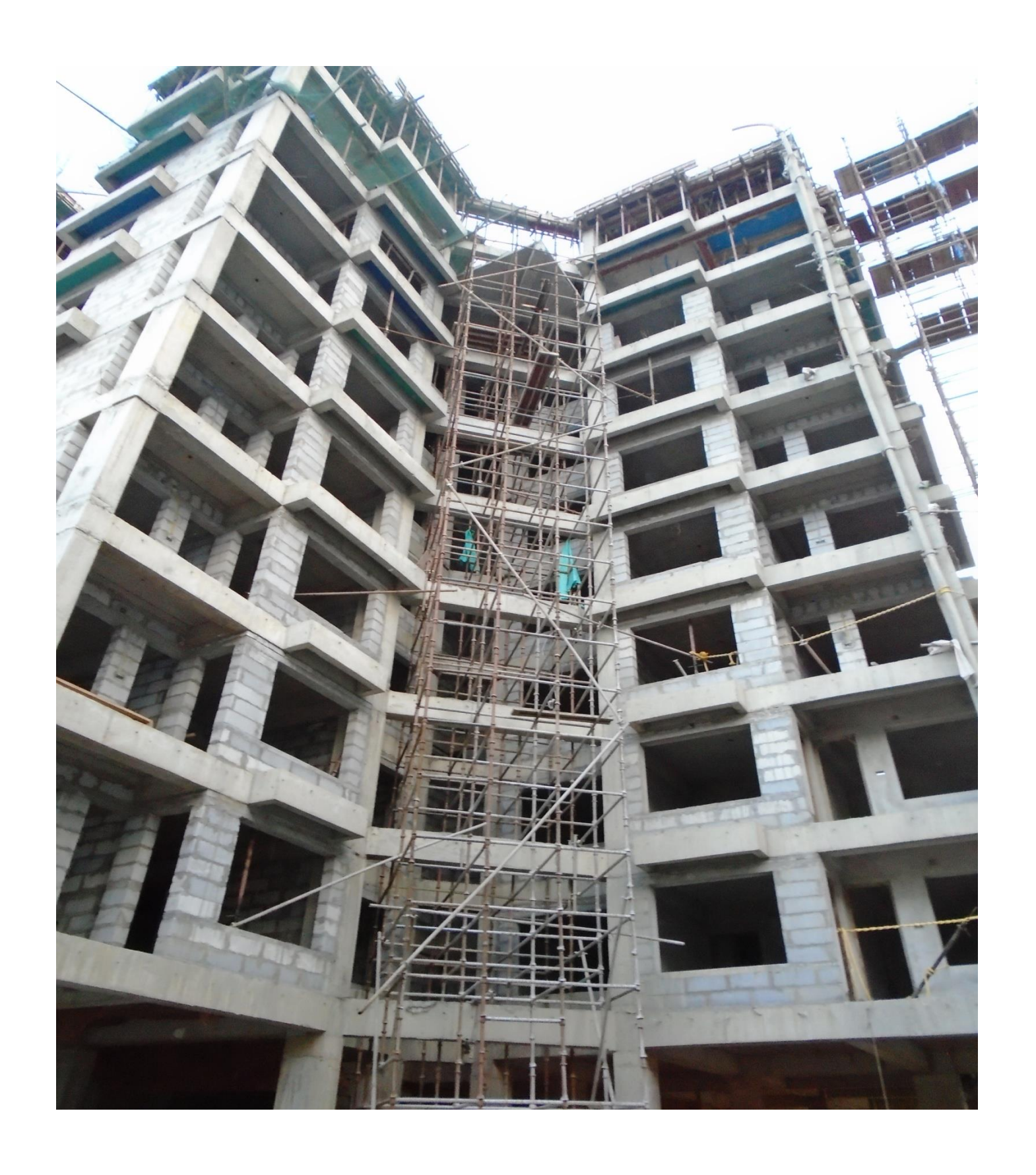
CLASSIC - 1