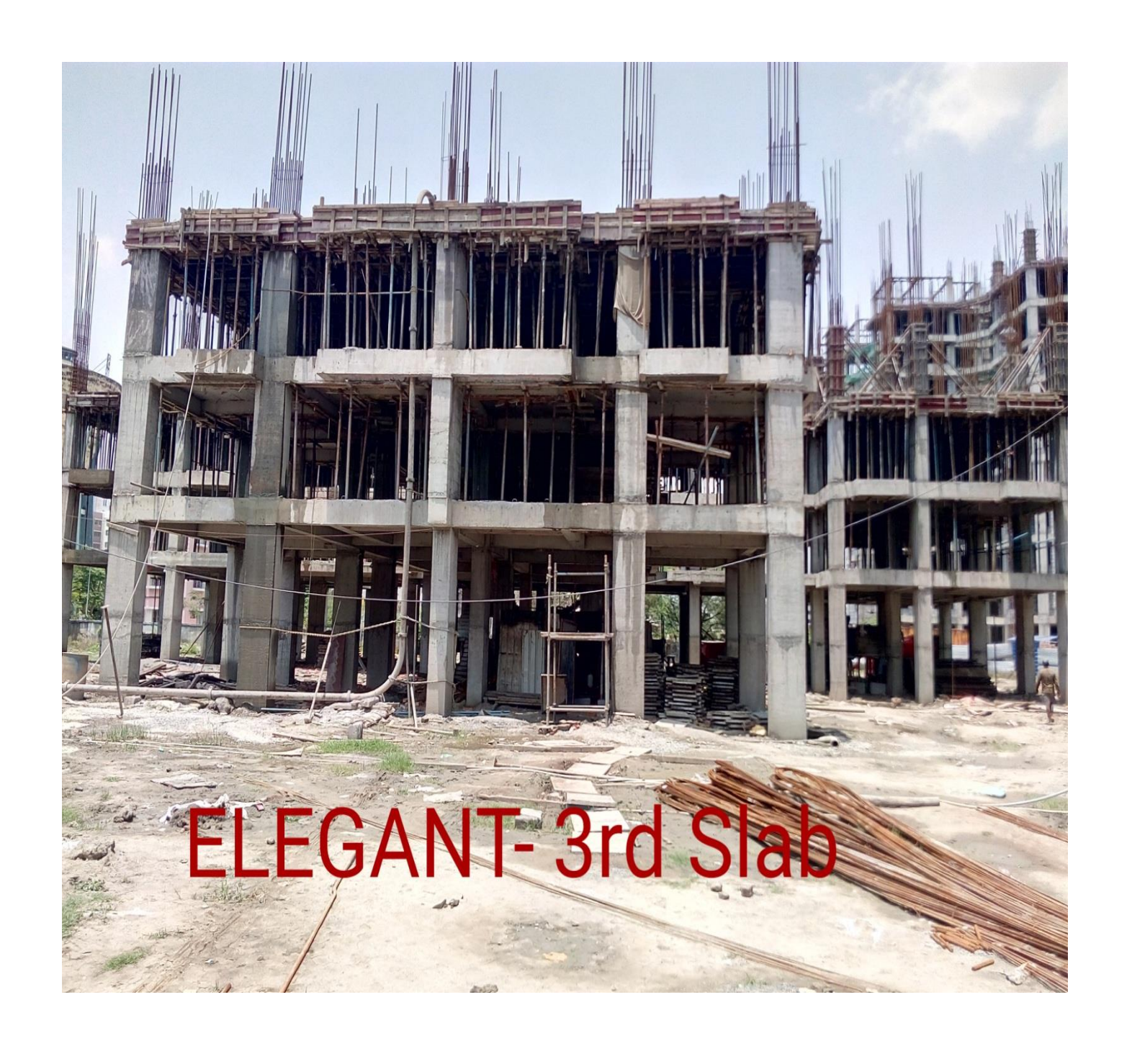
ELEGANT -3rd SLAB