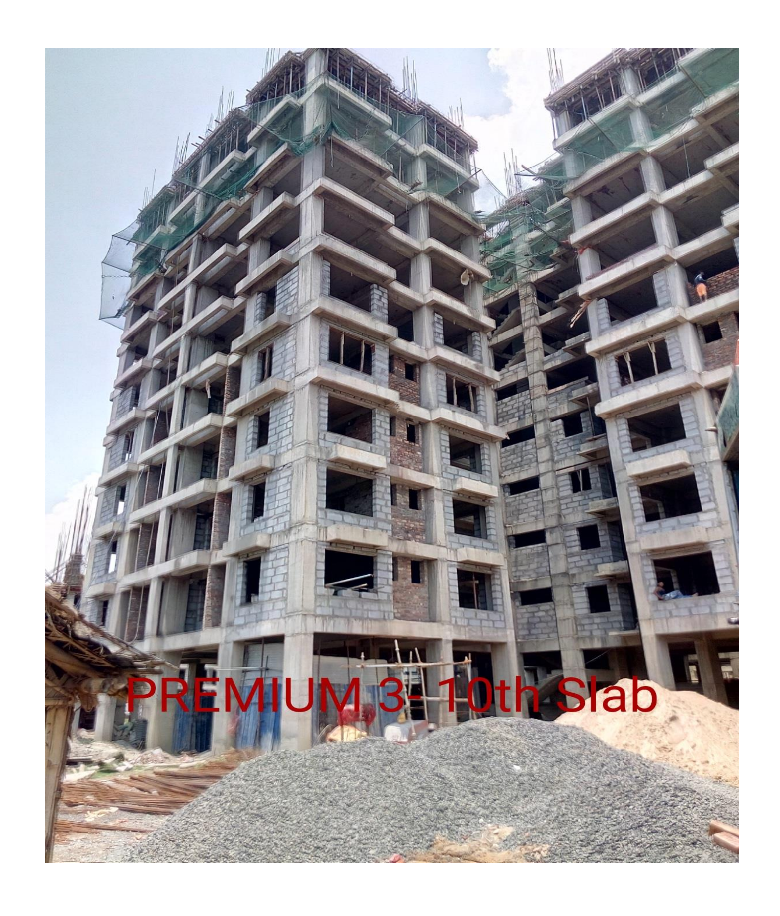
PREMIUM -3- 10th SLAB