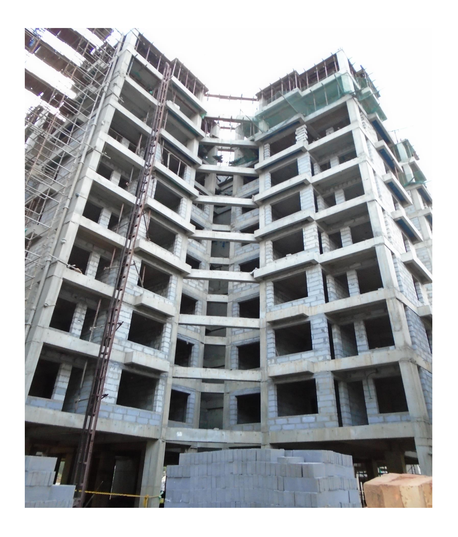
CLASSIC - 2